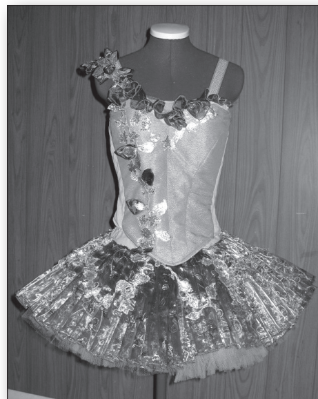
The Golden Vine Fairy Costume

Current plans for Swan Lake include 20 new white swan tutus, in addition to a new bodice, plate for the Black Swan, Odile, and a new coat for the Prince. So much volunteer time and hard work go into making the Ithaca Ballet's costumes