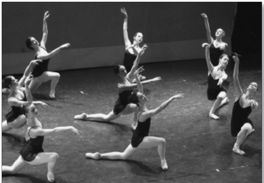
"Barcarola Veneciana," as performed at the Winterdance show at the State on February 27.

If you've not had the chance to send in your donation, now is the time! Please know that your membership gift really does make a difference in supporting this wonderful community treasure. Thank you again!