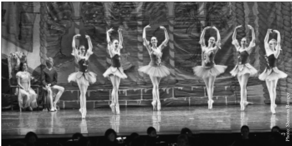
Waltz of the Flowers, Act II of The Nutcracker , at the State Theatre in December.

To buy 2010-'11 season tickets at this year's prices, visit www.ithacaballet.org , after May 1!