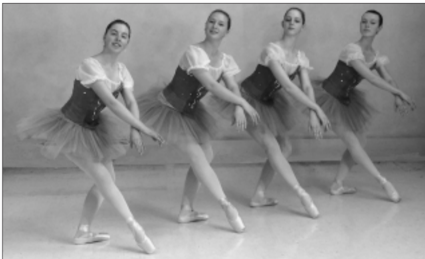
The maids in The Sleeping Beauty.