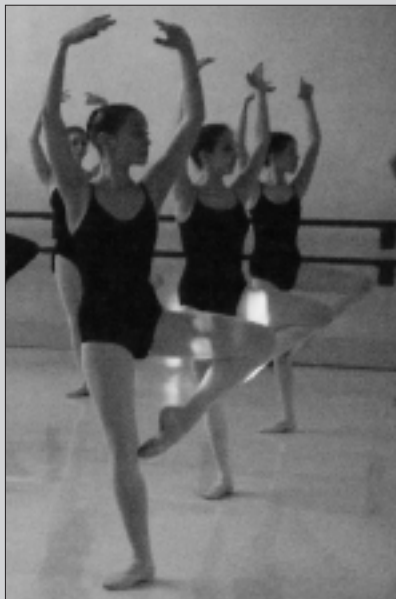
Students rehearse at the studio.

The Ballet Guild of Ithaca will offer its annual Summer Day Camp in dance this year from June 27-August 5, Monday through Friday. The first session is from June 27-July 15, and the second session is from July 18-August 5.